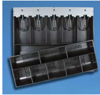
5 Bill / 9 Coin Insert Features Removable Coin Section with Adjustable Dividers