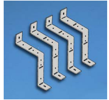
Easily Mounts Under the Counter with Optional Universal Brackets