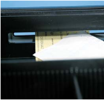
Large Flexible Storage Area Under the Coin Section