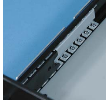
Drawer Glides Effortlessly on Side Rails with 24 Steel Ball Bearings per Rail