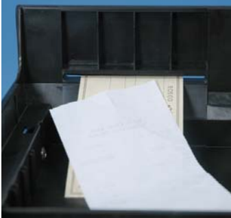
Checks And Card Slips Can be Inserted into the Media Slots Without Opening the Drawer