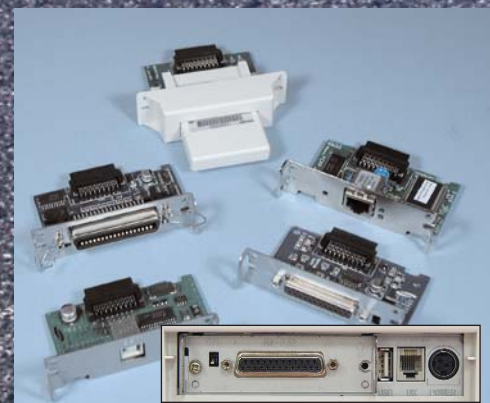
Easy to Change Interface Modules with USB 2.0 On Board Standard