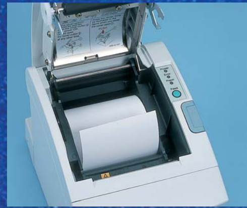
Drop and Print Paper Loading

All product features are subject to change without notice.