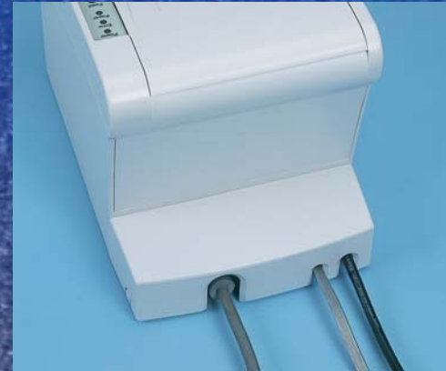
Standard Cable Cover