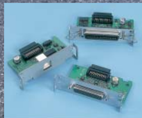
Easy to Change Interface Modules

All product features are subject to change without notice.