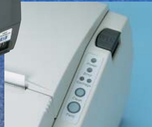
Easy to Use Control Panel