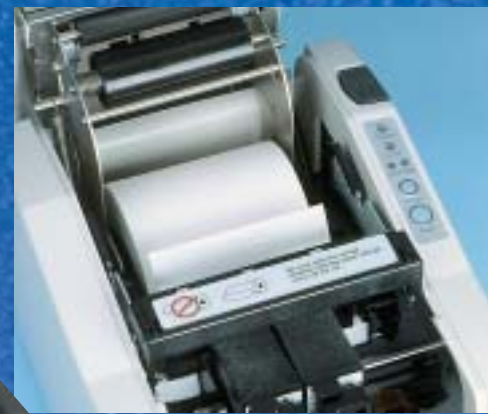
Drop and Print Paper Insertion