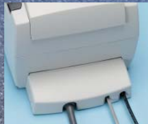
Standard Cable Cover